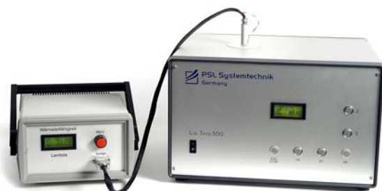
Lambda with LabTemp 300 – for high temperatures

Due to the very high speed of the thermo-electric heating/cooling and the extreme temperature homogeneity of the LabTemp 30190 short measuring times are achieved, thereby the measuring frequency is increased significantly. Only small volumes of sample (approx. 45 ml) are sufficient to execute reliable measurements.