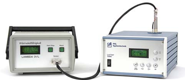
Measuring System Lambda with LabTemp 30190